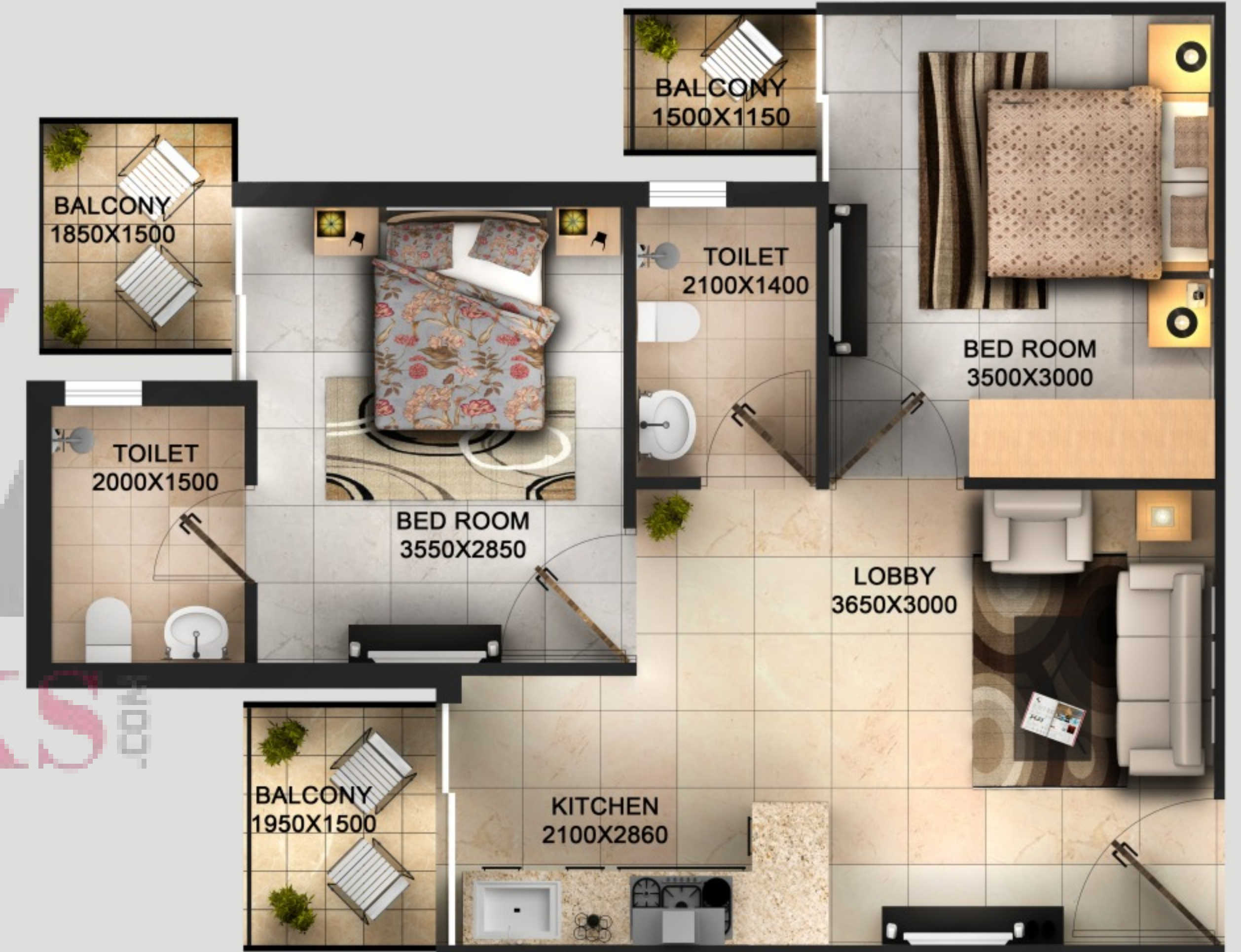
UNIT PLAN: 1BHK